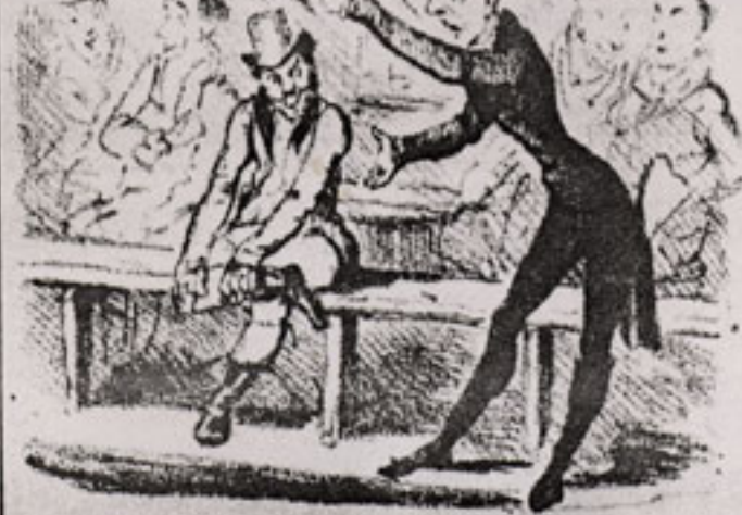
The M.P's who approve of the GOVERNOR

We are all Gentlemen the worthy Governor's a Gentleman the Platon are gentlemen a Slave's a Slave