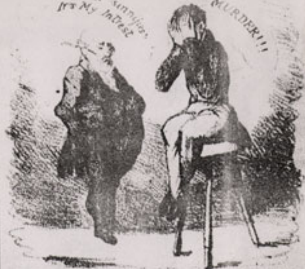
The ELECTORS who return the M.P !!!